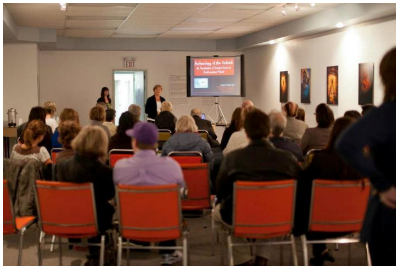
Winter lecture series proved to be popular programming for the museum

Although we continued to solicit private donations, apply for specific project grants and raise funds through corporate sponsorships and sale of boutique items, our bottom line was affected by the unexpected closure of the Polish Press CZAS office and rent of space in our building. Therefore, we experienced a small loss of $70.00 on our 2011 financial statement. A new fundraising initiative in early 2012 will be developed and should be instrumental in turning around our recent losses.