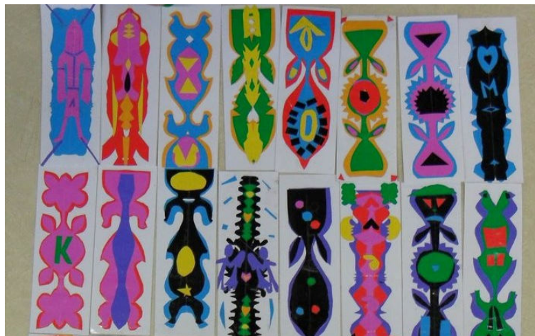
The results of students' diligent work – wycinanki workshop